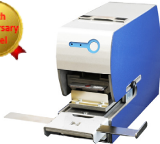
Model 15F Fixed Die Perforator