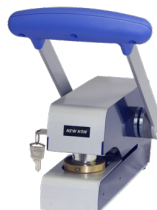
SecureSeal 60N Manual Embosser