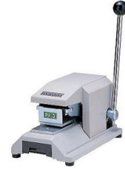
Model 206 Manual Perforator