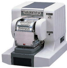
Model 10 Heavy Duty Perforator